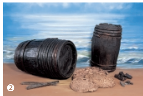
① Oak barrels ready for recovery. ② A composition of barrels, copper slabs and an iron bar from the wreck of the “Copper Ship”. ③ Diagram showing the location of the wreck following the removal of the ballast stones.