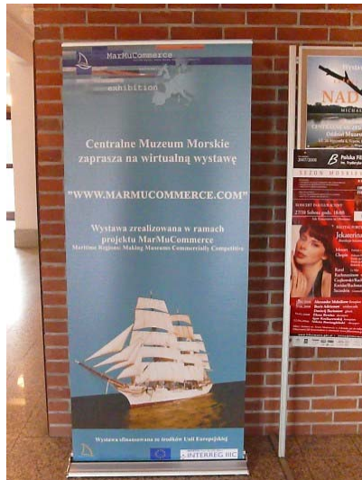
Roll-up at the main building of the Polish Maritime Museum in Gdansk, promoting MarMuCommerce