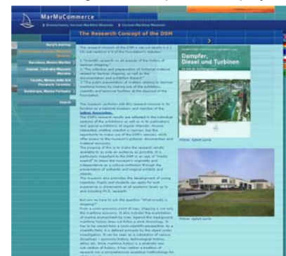
About the partners

The new MarMuCommerce website – with a more attractive design and content – substitutes the old one. This new website contains now not only information on the project, but also the joint virtual exhibition on the European Maritime Heritage and a database of good practice examples and the most significant outputs of the project.