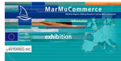
MarMuCommerce home page

The joint virtual exhibition has been finalised and is now available for the public under: www.marmucommerce.com