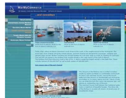
Joint virtual exhibition

To guarantee the durability of the project results, the consortium decided to keep on the maintaining of the MarMuCommerce website after the end of the project.