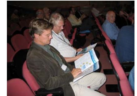
Participants of the event reading the MMC brochures

The International Congress of Maritime Museums in Malta (ICMM), from the 8 th to the 12 th of October 2007, was chosen for the presentation of the MarMuCommerce project results.