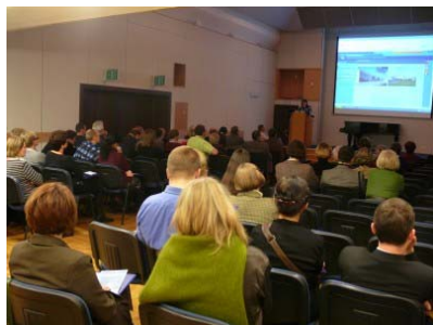
Conference: Museums in the Competition for Clients

The conference “ Museums in the Competition for Clients ” was organized by CMM on the 26 th of October 2007 to disseminate the MarMuCommerce project results among museum professionals of the Gdansk and Pomorze region.