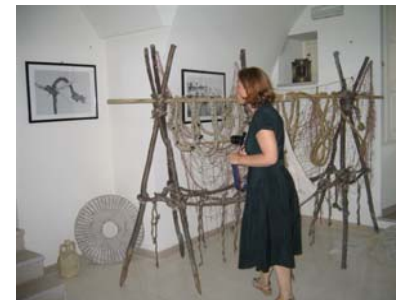
Museo delle arti piscatorie tarantine