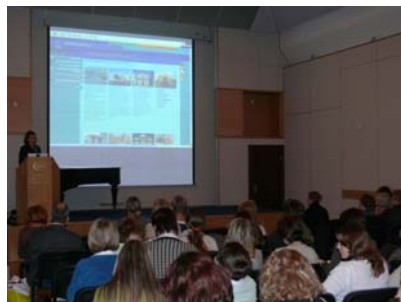
Conference: Internet in Education

The conference entitled “ Internet in Education ” was organized in CMM on the 12 th of November 2007 for a group of 90 teachers from Pomorze region. The MarMuCommerce joint virtual exhibition was presented as an example of a website of high educational and informative value. The teachers were given promotional leaflets and calendars.