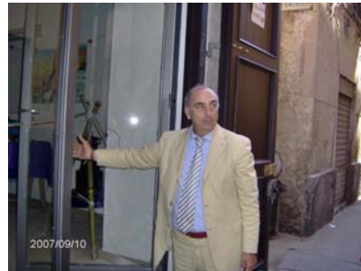
Opening of the Museo delle arti piscatorie tarantine

The formal opening of the "Museo delle arti piscatorie tarantine" at Palazzo Fornaro in Taranto was on the 11 th of September 2007.